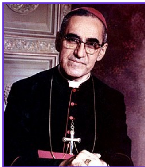
Above: St. Oscar Romero

We meet every other Thursday during lunch time in the Chapel. Our aim is to work together to build a deeper awareness of justice and peace issues in our school community. The mission of our group is to create awareness about war, poverty, inequality, homelessness, supporting refugees and environmental issues. Our team is inspired by the social teaching of the Church and the example of St. Oscar Romero, our Patron Saint, who is remembered for his outspoken support for social justice, courage, faith and, above all, his great love for the poor and oppressed.