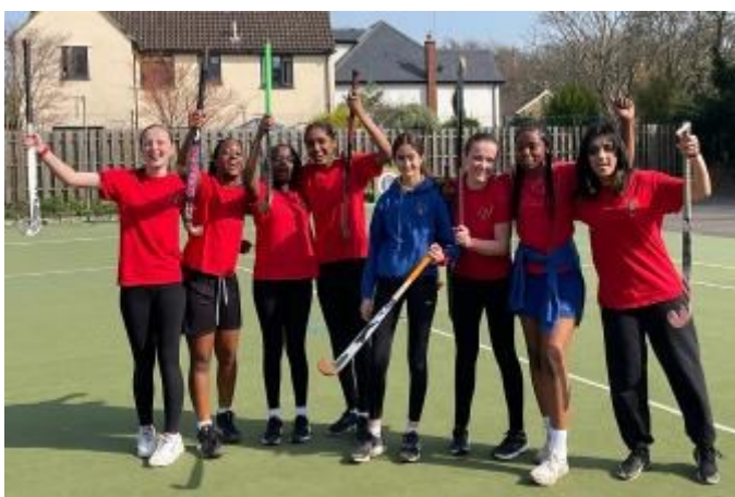
Images above and right are taken from some of the Interhouse events.

In the summer term, there will be Interhouse Rounders and Sports Day to look forward to.